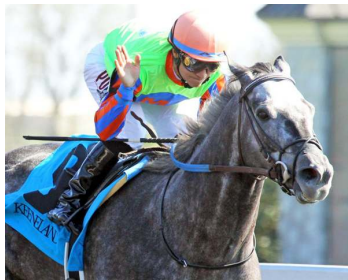
Frac Daddy

Coolmore's Scat Daddy had won the 2007 GII Fountain of Youth and GI Florida Derby but never ran again after finishing down the field behind Street Sense in the Derby. However, he edged out Hard Spun by $11,000 as leading freshman sire in 2011, though in 2012 Hard Spun was leading second-crop sire by $125,000 over Scat Daddy. In 2013 Darley scooped the first four placings on the third-crop sire list, with Street Sense, then standing a season in Japan, the leading third-crop sire, followed by Teofilo, Hard Spun, and Discreet Cat. Scat Daddy was fifth, with English Channel sixth. Cue Street Sense to return from Japan, Hard Spun to ship out for the 2014 season.