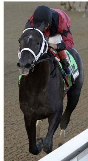
Cairo Prince

Among F2011 NA/EU sires with their first 3-year-olds this year, Gilttown Stud's Sea the Stars , Galileo's half-brother and the sire of two 2014 Classic winners, leads the list with 14 ABC Runners this year. Maybe a surprising second is France's Haras de la Cauviniere's Le Havre , sire of dual French Classic winner Avenir Certain, who remained unbeaten when leading home a Le Havre one-two in yesterday's G2 Prix de la Nonette at Deauville. I wouldn't necessarily have predicted a revival of the Blushing Groom sire line through a son of Noverre, but Le Havre had 12 ABC Runners this year through July 8. After yesterday's race Avenir Certain is 14-1 equal fifth choice for the G1 Prix de l'Arc de Triomphe on Betfair--not a bad 'each-way' (Win & Show) bet. She definitely won with her head in her chest yesterday and she is unbeaten. WinStar's