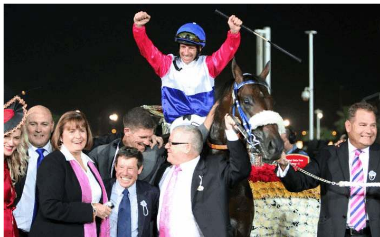
Jay Peg (SAf) (Camden Park), winner of the 2008 G1 Dubai Duty Free and South Africa's leading money winner. His first yearlings will sell at the Cape Premier Sale.

Racing was designed as sport and entertainment, and it's easy to be focused on the business of trading and the business of betting as if that's all there is to it. Keeneland offers a purer racing product, where the sport and elegance are reminiscent of a bygone era. Cape Town aims to offer the Cape experience--epic scenery and great beauty, glorious sun-drenched beaches, panoramic mountain vistas and leafy green winelands, wrapped in a laid-back lifestyle by day and party time at night. There can be few better ways to conduct business!