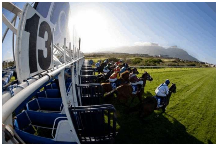
Off and running at Kenilworth...