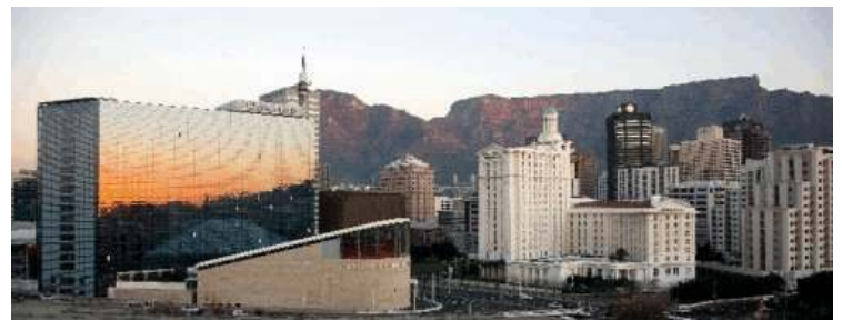
Cape Town Convention Centre, site of the Cape Premier Yearling Sale

As dollars and pounds sterling stretch far in our exchange rate, even a small buyer feels like a millionaire! (The median price last year was $32,500; the top price $305,000, which is R2.5 million in local currency).