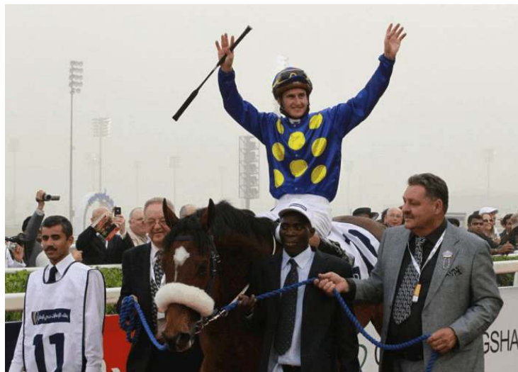
J J the Jet Plane (SAf) (Jet Master {SAf}), winner of the '10 G1 Hong Kong Sprint and '11 G2 Al Quoz Sprint