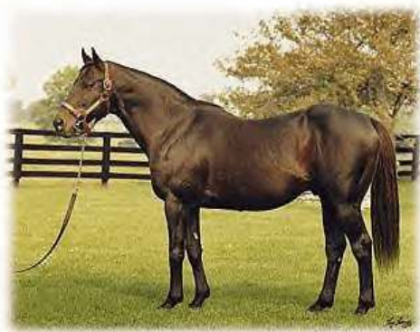
Seattle Slew