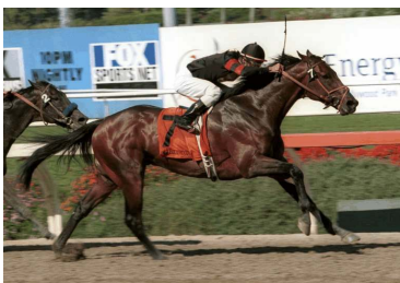
Euchre winning the 2000 GII Bel Air H. at Hollywood