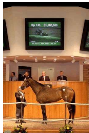
$1.9 million sale topper, Hip 111

Stormy Atlantic (Storm Cat) made a big splash at the Barretts March Sale of Selected Two-Year-Olds in Training last night when a filly from his first crop topped the auction with a world-record $1.9-million price tag.