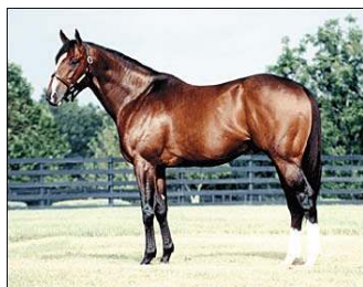
Stormy Atlantic