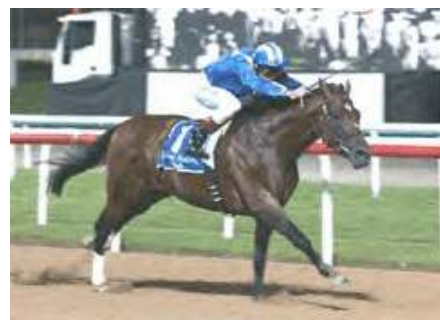
Sakhee at Nad Al Sheba

Sakhee (Bahri) heads an 11-strong list of acceptors for the $6 million G1 Dubai World Cup at Nad al Sheba Mar. 23. Godolphin's five-year-old, winner of last year's