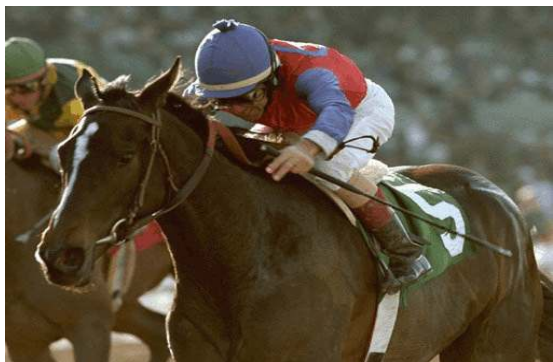
You Wins Santa Anita Oaks

For the second time in their budding rivalry, You (You and I) bested Habibti (Tabasco Cat) as the dark bay got first run turning for home and was able fend off her chestnut foe by a half-length in the GI Santa Anita Oaks yesterday afternoon. The GI Frizette S. heroine by 6 1/4 lengths last October, You finished fourth as the favorite in the GI Breeders' Cup Juvenile Fillies, with Habibti back in seventh. The Thoroughbred Corp. colorbearer denied You by a head in the GI Hollywood Starlet Dec. 16, but the Bobby Frankel trainee bounced back to take the GI Las Virgenes S. going a mile at Santa Anita Feb. 10. Settled into striking position just three lengths from the front, 4-5 You came four wide into the stretch, fought her way past Ile de France (Storm Cat) and had enough left to prevail over the late-charging Habibti. "He [jockey Jerry Bailey] didn't want to hit the lead too soon, 'cause if you notice, when she hits the lead she pulls up," remarked winning trainer Bobby Frankel. While Frankel was pleased with Bailey's ride, trainer