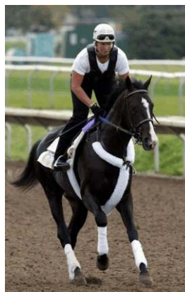
Repent at Fair Grounds

Repent (Louis Quatorze) has come a long way since finishing second at 42-1 in the GI Breeders' Cup Juvenile Oct. 27, adding a pair of graded-stakes triumphs to his resume which make him the 1-2 favorite on the morning line in the $750,000 GII Louisiana Derby this afternoon at Fair Grounds. The dark bay colt made his three-year-old bow over course and distance Feb. 17 in the GIII Risen Star S., rallying eight wide into the