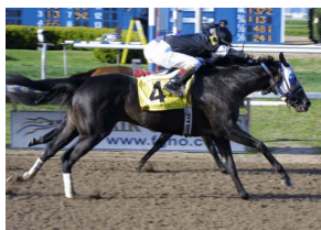
Repent Captures Louisiana Derby

He may have been in the Big Easy, but yesterday's GII Louisiana Derby was anything but an easy victory for Repent (Louis Quatorze). The colt, second in last year's Breeders' Cup Juvenile, ended his two-year-old campaign with a win in the Nov. 24 GII Kentucky Jockey Club at Churchill. He returned this year with a solid 2 1/4-length victory in the Feb. 17 GIII Risen Star S. at Fair Grounds. Yesterday, with new jockey Jerry Bailey up, Repent drifted out at the break and brushed with Publication (Petionville) before being straightened out. He settled into fifth behind slow early fractions of :24