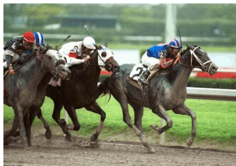
Nokoma Wins at Gulfstream Equi-Photo

Nokoma (Pulpit) had his final prep for Saturday's GI Florida Derby yesterday morning, zipping five furlongs in a bullet :58 1/5 over a fast Gulfstream main strip.