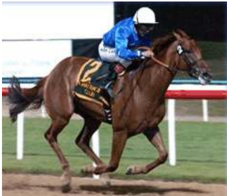
Infinite Spirit at Nad al Sheba