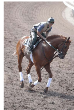
Blue Burner