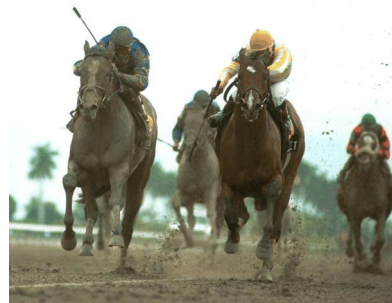
Booklet (right) wins Fountain Of Youth