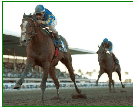
Harlan's Holiday Wins Fla Derby