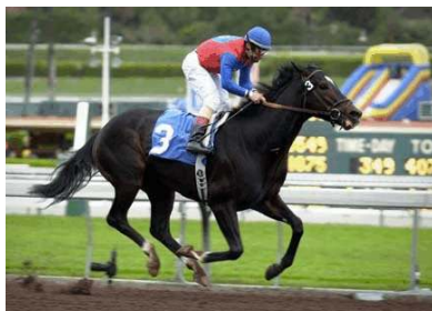
Medaglia d'Oro Wins San Felipe Horse-Photos