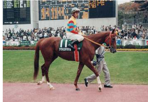
Agnes Digital in Japan

World Cup hopefuls Royal Tryst (Kingmambo) and Keltos (Fr) (Kendor {Fr}) worked yesterday at Nad al Sheba. Royal Tryst went 1200m over the turf in