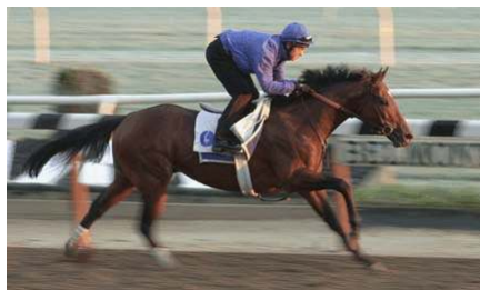
Sakhee at Belmont Park Horse Photos

Bookmakers Paddy Power yesterday opened a book on the margin of victory should Sakhee win today's G1 Dubai World Cup.