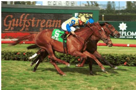
The latest GSW for Kris S. - #5, Julie Jalouse, wins Orchard H.