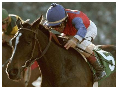
You Takes the Santa Anita Oaks

at least $1 million. Overall, his progeny from 17 crops to race have earned more than $48 million. Kris S. has also sired You and I, winner of the GI Met Mile and himself the sire of MGISW You. Prior to his injury, Kris S. covered 10 mares, and six of the 10 have been pronounced in foal.