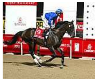
Street Cry at Nad al Sheba