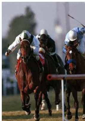
Tout Charmant (left) winning the Matriarch