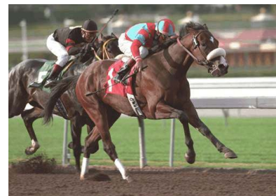
Sunday Break at Santa Anita

Sunday Break (Jpn) (Forty Niner) overcame himself and a stewards' inquiry to win yesterday's sixth race at Aqueduct by a length. Settled in second behind a deliberate pace set by Tomahawk Lake (Devil His Due), the bay edged to the front approaching the quarter pole, but that's where this adventure begins. The Neil Drysdale-trainee drew clear when asked in upper stretch, but ducked in suddenly with a furlong to run, nearly unseating jockey Gary Stevens. Straightened away shortly thereafter, the colt veered in again at the sixteenth pole, causing jockey Richard Migliore aboard Tomahawk Lake to steady briefly along the inside, but Sunday Break dug back in and was ridden out to the victory.