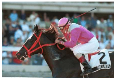
Hal's Hope at Gulfstream

A small but talented field of five has been entered for Saturday's GI Gulfstream Park H. and four of those five entrants already have Grade I victories on their re-