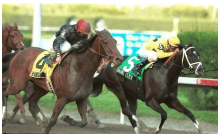
Cat Cay (left) wins Shirley Jones

Raging Fever in the six-furlong GIII First Lady H. at Gulfstream in their respective seasonal bows Jan. 11, but turned the tables on her younger rival in their most recent meeting, winning the seven-furlong GIII Shirley Jones H. by a neck