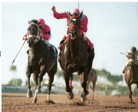
Hal's Hope Triumphs