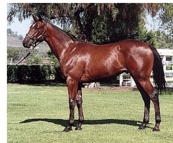
Red Ransom colt, Lot 204

Vinery Australia is fast gathering momentum, with an Easter draft more than double in number on the previous year and an impressive crop of yearlings by freshmen Red Ransom and Gilded Time. Gilded Time has already been particularly well-received at Australasian majors in 2002, topping the Melbourne Premier on average, and Red Ransom has 18 yearlings by top shelf broodmares such as Startling Lass (Aus) and Rossignol (Aus), the dam of the 2001 Easter sales topper by Danehill. "Overall, the consensus is that Red Ransom has a great bunch of horses here and Hong Kong and overseas buyers in particular are likely to appreciate them," said Vinery's Colm Santry of the eye-catching draft by the Roberto horse. Among Vinery's stand-outs is a Red Ransom half-brother to G1 VRC Derby winner Hit The Roof (NZ), Lot 204. However, Vinery's shining lights for 2002 could come from proven Southern Hemisphere sources, with Lot 271, a Zabeel (NZ) colt from G1 Melbourne Cup winner Let's Elope (NZ) (Nassipour) among its stars. Vinery is also acting as agent for Kia-Ora Stud, which will sell under its own banner next year after undergoing extensive redevelopment. Kia-Ora's draft includes a Zabeel colt from champion three-year-old filly Danendri (Aus), selling as Lot 125.