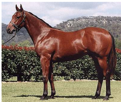
Danehill colt, Lot 72

The tale of the 2002 Inglis Easter Yearling Sale, which begins today in Sydney, Australia, can be summed up in just one word: Danehill. The ubiquitous sire began with 56 catalogued for the Southern Hemisphere's premier sale and, even after withdrawals, 50 remain, including a yearling to be offered on opening day by Collingrove Stud that will vie for sale-topping status. Last year, Collingrove sold the sale-topping Danehill colt for A$1.1 million. This year,