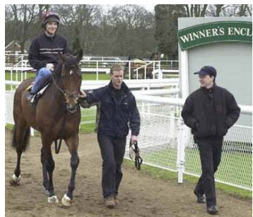
Johannesburg, shown here at Lingfield, will race Sunday at The Curragh Arena Leisure PLC

Johannesburg (Hennessy) will run in Sunday's seven-furlong G3 Gladness S. at The Curragh, it was revealed yesterday. Although a cross-channel excursion for Lingfield's Foster's International Trial S. on Saturday had been considered, trainer Aidan O'Brien told the Sporting Life website that improved weather would keep the colt at home. Castle Gandolfo (Gone West),