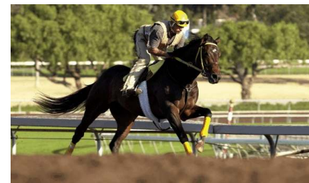
Came Home galloping at Santa Anita

heredity and genetics with horses that I would much prefer to go with a horse that's got class and sheer talent, rather than dwell on how well-bred they are and what their particular breeding might dictate." Mayakovsky shipped to the East