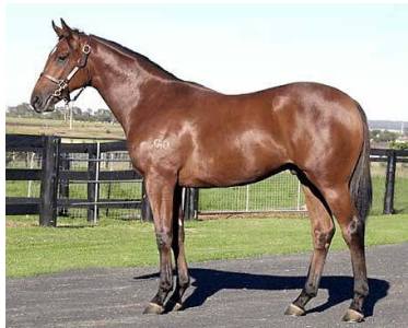
Danehill colt, lot 529

Gooree Stud's Tic Tic Trinidad, underbidder on the eventual topper, emerged beaming on the balcony after outlasting four underbidders to secure Lot 529, a Danehill--Verocative (Aus) (Bletchingly {Aus}) colt for $1.4 million from the draft of Highgrove Stud. "We love him. We loved him straight away," Trinidad said. "We only had two horses to bid on today and we missed out on the filly, but tried harder for the colt." While show-