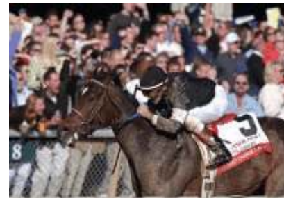
Taking charge at Keeneland