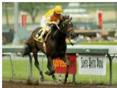
On to Louisville for Came Home

Jockey Chris McCarron said on Thursday that he'd rely on talent and class and leave issues of pedigree and staying ability to those who would pronounce themselves experts. On Saturday, the Hall of Fame rider had to call on every ounce of talent and class residing within Came Home (Gone West) and the colt who supposedly "couldn't" re-