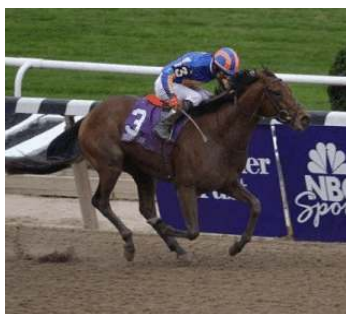
Johannesburg at Belmont

furlong event, finished second, a short head behind four-year-old filly Rebelline (Ire) (Robellino). In the early going, Johannesburg raced wide, traveling on the bridle throughout before being asked to quicken away in the final 150 yards, but he could not hold off the late-closing filly. A disappointed trainer Aidan O'Brien said afterwards, "Johannesburg just ran too keen and over-raced early on. I don't know where he will go now, but it's a long way away from being a problem." ( Gladness recap cont. p. 3 )