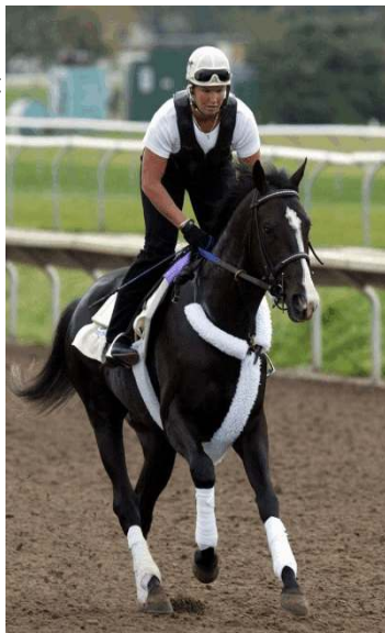
Repent Training at Fair Grounds