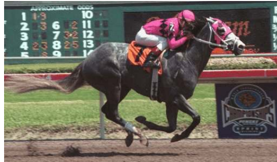
Buddha Winning at Gulfstream