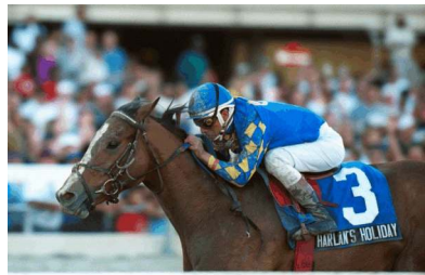
Harlan's Holiday Take Florida Derby

It's the Final Four of Thoroughbred racing. The last four major preps for the GI Kentucky Derby will be held this afternoon and, when the cameras quit clicking, the picture for the 128th running of the GI Kentucky Derby will be sharply in focus. Harlan's Holiday (Harlan) holds