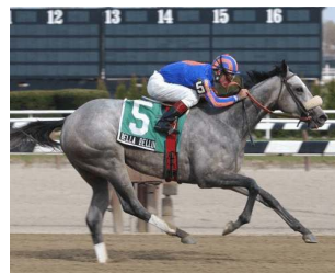
Bella Bellucci Wins Comely

Bella Bellucci (French Deputy) proved she was a force to be reckoned with in the already contentious three-year-old filly division with a commanding seven-length victory in yesterday's GIII Comely S. at Aqueduct. The gray filly, winner of the GII Astarita in only her second start last October, suffered her first defeat when third in the GI Breeders' Cup Juvenile Fillies, her only try over