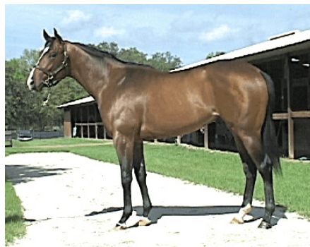
Hip 31 - Royal Academy colt

Keeneland's April Two-Year-Olds in Training Sale, which celebrates its 10th edition today, has already produced such outstanding runners as champion Beautiful Pleasure, GI Kentucky Oaks winners Gal In A Ruckus and Keeper Hill and GISW Victory Ride. Buyers will be out in force, looking for the next superstar among the 249 juveniles catalogued for this year's sale, which begins this afternoon at 1:30 p.m. The single-session event features a who's who among established sires, including A.P. Indy, Carson City, Dehere, Deputy Minister, Forest Wildcat, French Deputy, Gone West, Hennessy, Kingmambo, Kris S., Louis Quatorze, Mt. Livermore, Phone Trick, Rahy, Royal Academy, Saint Ballado, Theatrical (Ire) and Unbridled's Song. The catalogue also includes one colt from the final crop of the late Mr. Prospector out of MGISW