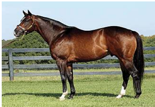
2001 Leading Freshman Sire Valid Expectations Forrest Photos

Valid Expectations started the year off strongly and kept up the pace through Dec. 31, coming up with 27 individual winners. The nine-year-old son of Valid Appeal sired six stakes horses overall and three stakes winners, headed by Expected Program. This half-brother to top sprinter Caller One captured the