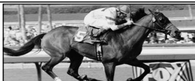
Multiple G1 winner Deputy Commander was the leading money-winning 3-year-old of his crop