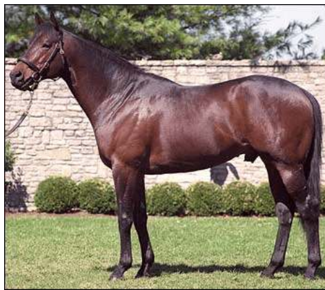
Will Grand Slam be a Big Hit?

But any or all of these are eligible, on their numbers, to surprise all. I refer to: Gainesway's Formal Gold (Black Tie Affair); Walmac's Argentinian-bred Gentlemen (Robin des Bois); Hopewell's Skip Away (Skip Trial), who ran eight consecutive races with figures of 115-125; and Brookdale's Will's Way (Easy Goer). Considering they constituted the best group of older horses seen in America for 20 years, don't be too surprised to see one or more of them make the grade. Cont. p2