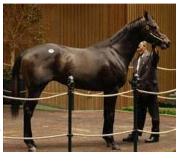
Hip 97 by Unbridled's Song