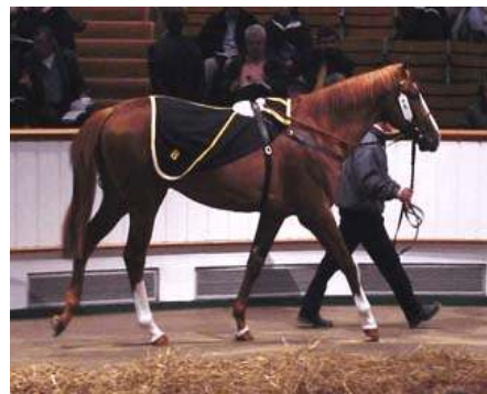
Selkirk Colt Tops Breeze-Up Day 1