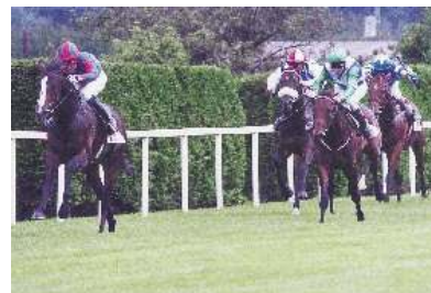
Minardi winning the Phoenix