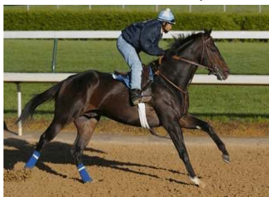
Medaglia d'Oro at Churchill

Jockey Chris McCarron, aboard for the work, added, "He went very well and got across the track beautifully. I expect to him to improve off the Santa Anita Derby. It is not a hope, it's an expectation."... Medaglia d'Oro (El Prado {Ire}), second in the GI Wood Memorial, worked five furlongs at