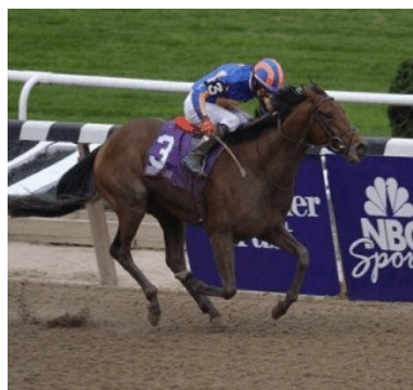
Kinane, Johannesburg at Belmont