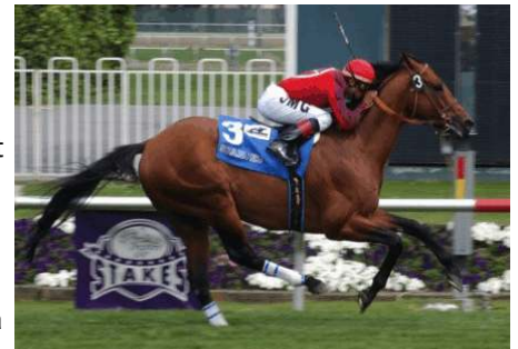
Suances Winning at Bay Meadows