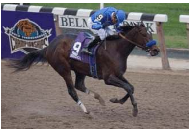
BC Juvenile Fillies