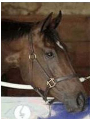
Tempera

Last year's champion two-year-old filly Tempera (A.P. Indy) was humanely euthanized Sunday evening at the Hagyard-Davidson-McGee Veterinary Clinic in Lexington after developing colitis and laminitis. The Godolphin