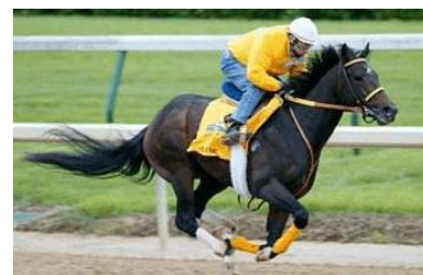
Came Home at Churchill