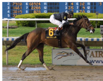
Take Charge Lady at Fair Grounds