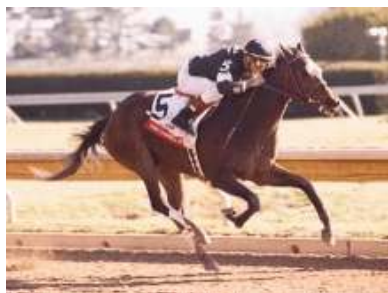
Take Charge Lady scores the Ashland