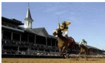
Farda Amiga

FARDA AMIGA UPSETS TAKE CHARGE LADY IN THE OAKS, p4