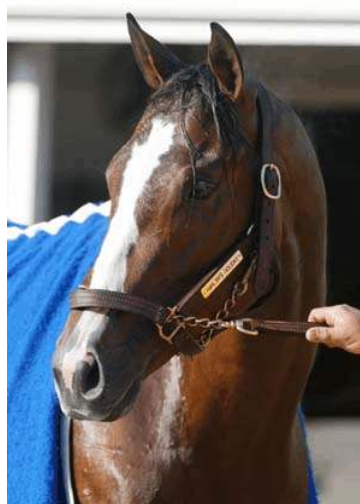
Harlan's Holiday in the Churchill paddock

"It has been an interesting sophomore year, class. Unfortunately, Repent and Siphonic and Buddha ( see p8 ) are on sabbatical, but to the rest of you, good luck in your final exam. Your mission--win the 128th GI Kentucky Derby." Those were the words of Professor Louis Ville, who is having a difficult time evaluating exactly who might pass his exam. There is Harlan's Holiday (Harlan), the valedictorian of the bunch and race favorite based on his victories back-to-back in the