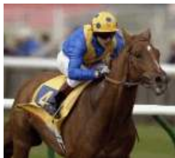
King Of Happiness wins Craven

Hawk Wing (Woodman) heads a field of 22 in today's G1 Sagitta 2000 Guineas at Newmarket, but this is a vintage renewal, with nine colts rated above 110 pounds in the 2001 International Classifications in the line-up. The one-mile Classic is dominated by the stables of Aidan O'Brien, Michael Stoute and Saeed bin Suroor, who are responsible for the last six winners between them, and for five of the first six in the betting this time. Stoute, whose five Guineas