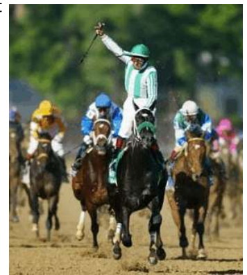
War Emblem Takes Derby

"ROCK" SOLID FINISH IN 2000 GUINEAS.....p2 QUEEN'S LOGIC GUINEAS START IN DOUBT....p3 MORE ON THE KENTUCKY DERBY.....p4