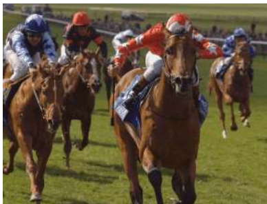
Rock Of Gibraltar at Newmarket

Rock of Gibraltar (Ire) (Danehill) was sent off a generous 9-1 shot, but outlasted stablemate and 6-4 favourite Hawk Wing (Woodman) to give Team Ballydoyle the one-two finish in the G1 Sagitta 2000 Guineas at Newmarket yesterday afternoon.