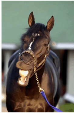
War Emblem

He was given little chance by the 145,033 fans at Churchill Downs yesterday afternoon, but GII Illinois Derby winner War Emblem (Our Emblem) stole the show, leading nearly every step en route to a four-length victory in the 128th running of the GI Kentucky Derby. "That horse had his way the whole way and he just kept on going," jockey Eddie Delahoussaye, third aboard Perfect Drift (Dynaformer), said. Completely underestimated by the connections of his 17 rivals, the 20-1 shot was allowed to set an uncontested pace, with GII Coolmore Lexington S. hero Proud Citizen (Gone West) sitting second and Perfect Drift an unexpectedly close third. That was the order as they raced around the first turn, travelled the backstretch and came out of the final bend. Proud Citizen and Perfect Drift tried to make a race of it, but War Emblem simply opened it up in the final furlong.