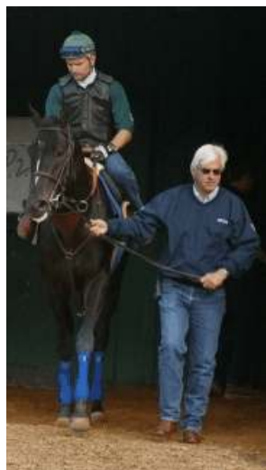
War Emblem & Bob Baffert

For the first time since horsemen started chasing the Holy Grail that is a sweep of the Kentucky Derby, Preakness and Belmont S., American racing is without a living Triple Crown winner.