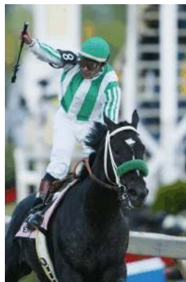
War Emblem

Bob Baffert has been down this road before, guiding both Silver Charm (1997) and Real Quiet (1998) to victory in two-thirds of the Triple Crown, only to see both colts shot down at Belmont Park. But he is optimistic about his chances at the Belmont S. this time. "I think the experience is going to help," he said. "We've gone through this before. The main thing is to keep the horse healthy and keep Victor [Espinoza] healthy--he has this horse figured out. The pressure is on now, and I'm sure there will be new shooter and new rabbits, but we'll be ready for them." The third leg of the Triple Crown will be run June 8.