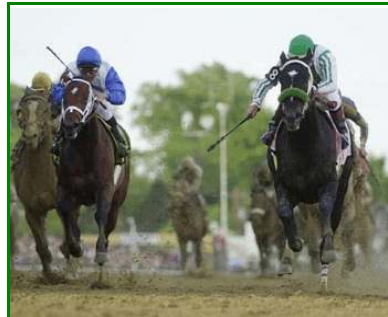
War Emblem (right) takes Preakness

Proving that the Kentucky Derby was no fluke, War Emblem (Our Emblem) stormed down the stretch at Pimlico yesterday afternoon to win the GI Preakness S. by 3/4 lengths, moving one step closer to Triple Crown glory. "We found out today that this horse is for real," trainer Bob Baffert said.