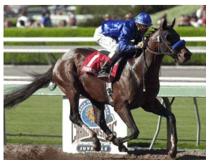
Essence of Dubai

Other possibles include: Azillion (Ire) (Alzao), Magic Weisner (Ameri Valay), Puzzlement (Pine Bluff), Request For Parole (Judge T C), Sarava (Wild Again), Sunday Break (Jpn) (Forty Niner), Tracemark (Conquistador Cielo), Like A Hero (Pleasant Colony) and Wiseman's Ferry (Hennessy). The status of both Azillion and Like A Hero will be clarified after they start in Thursday's $75,000 Alydar S. at Hollywood Park. Sunday Break and Puzzlement are scheduled to run in Saturday's GI Peter Pan at Belmont.