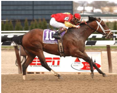
Affirmed Success Takes Carter H.

Both Left Bank (French Deputy) and Affirmed Success (Affirmed) have shown a fondness for the main track at Belmont Park in the past, each winning five of his seven starts over the course. The two will put their stellar Belmont records on the line in the G1 Met Mile this afternoon. Eight-year-old Affirmed Success bids for his third straight victory in the $750,000 event. The ultra-consistent bay captured the Mar. 16 Toboggan H. and the Apr. 13 G1 Carter H. at Aqueduct in his last two starts, both