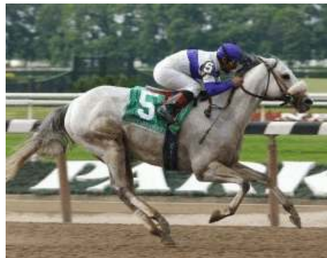
Swept Overboard

The last time Swept Overboard (End Sweep) ventured to Belmont Park, he rallied up a dead rail for fourth in the GI Breeders' Cup Sprint Oct. 27, but the five-year-old made amends yesterday afternoon with an eye-catching victory in the GI Metropolitan Mile. The nearly white Florida-bred had been one of the nation's most