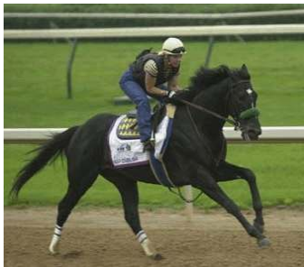
War Emblem at Churchill