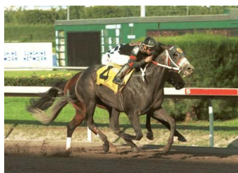
Macho Uno Wins at Gulfstream Equiphoto

A field of nine lines up for the 63rd running of the GII Massachusetts H. at Suffolk Downs this afternoon, including millionaires Macho Uno (Holy Bull) and Include