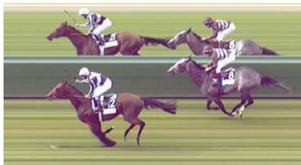
French Derby Finish Photo